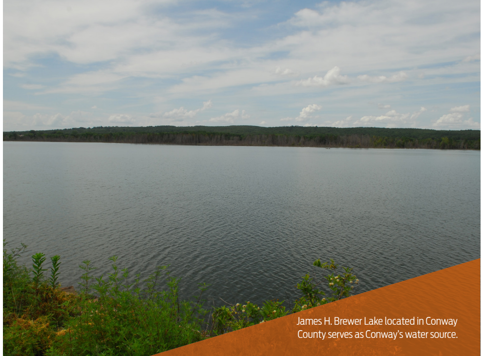
James H. Brewer Lake located in Conway County serves as Conway's water source.

Commission on forest management practices to reduce the amount of organic growth that washes into the lake. We have just completed a controlled burn and are working on