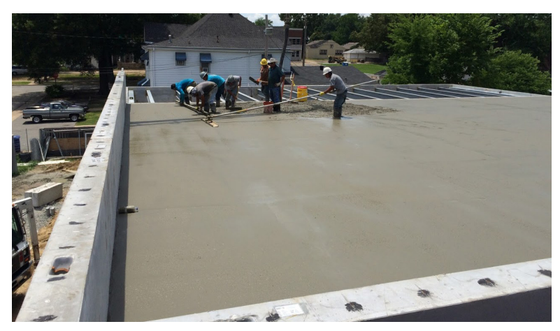
Conway Corporation's new data center is constructed to withstand winds up to 250 miles per hour.

"We are extremely proud of this data center and how it will help us continue to deliver reliable and innovative technology services to our customers."