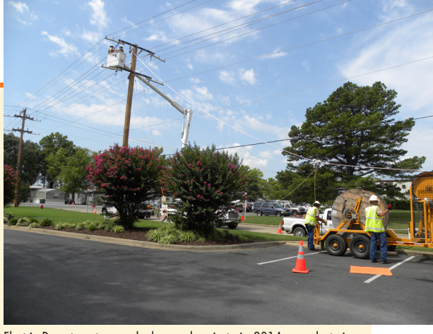
Electric Department crews had several projects in 2014 reconductoring circuits. Reconductoring upgrades the current carrying capacity of distribution line circuits.

Conway Corporation launched a new responsive design of its conway-corp.com website in late October. The new site, the first major redesign since 2006, adapts for optimum viewing across all devices including